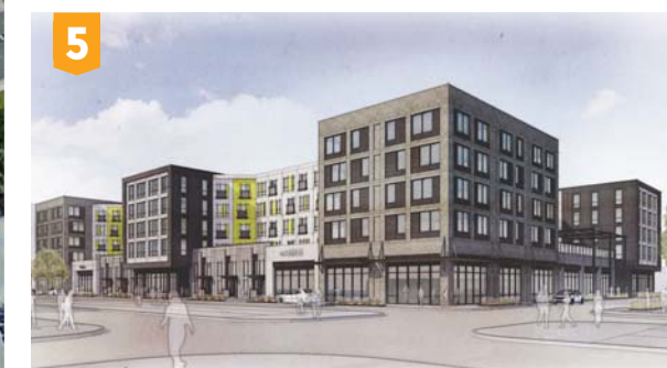
OPENING 4Q 2018 Ascent Westminster 270 units/24k s.f. retail