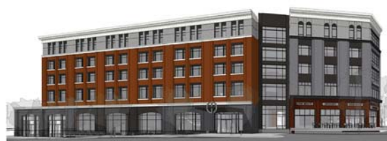
OPENING 1Q 2019 Origin Hotel/Marczyk Fine Foods 125 room boutique hotel w/retail