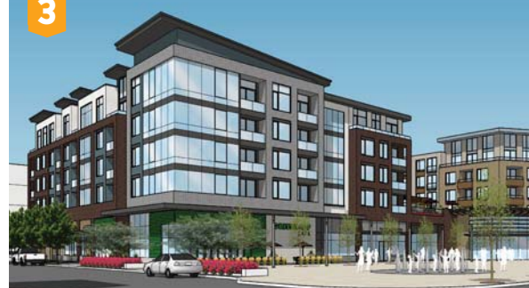
OPENING 3Q 2019 Sherman Associates 240 units/38k s.f. retail