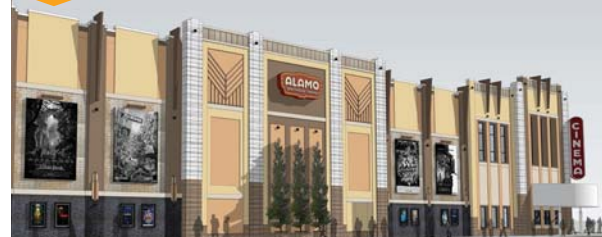
OPENING 4Q 2018 Alamo Draft House 9 screen theater/restaurant