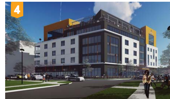
OPENING 1Q 2019 GRID Collaborative/Solera Salon 80k s.f. office/30k s.f. retail