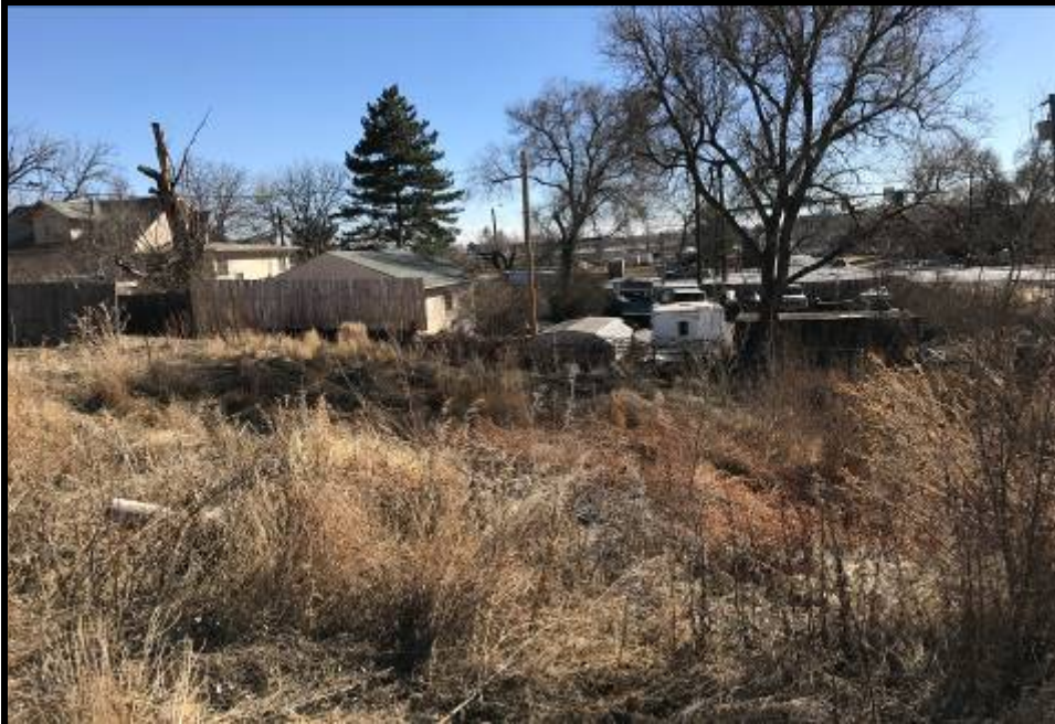
Photo 19: East View of Urban Plumbing at 7212 Bradburn with Bradburn Boulevard in Foreground