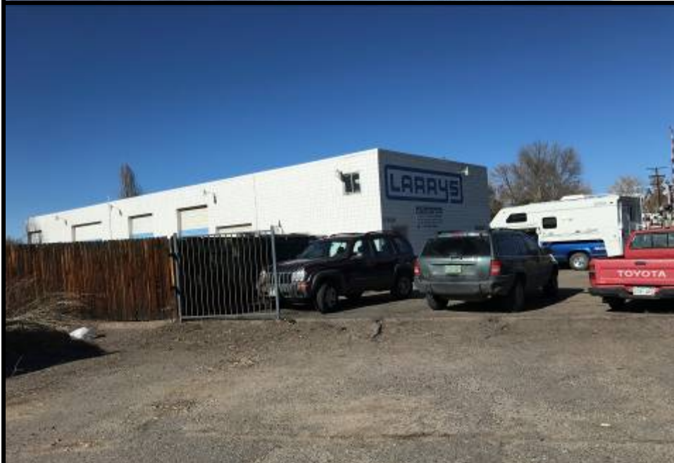
Photo 18: Adjacent North View of 7231 Bradburn - Larrys Automotive