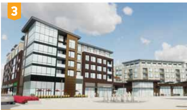
3 OPENING Q1 2021 Aspire Westminster 226 units/38k s.f. retail