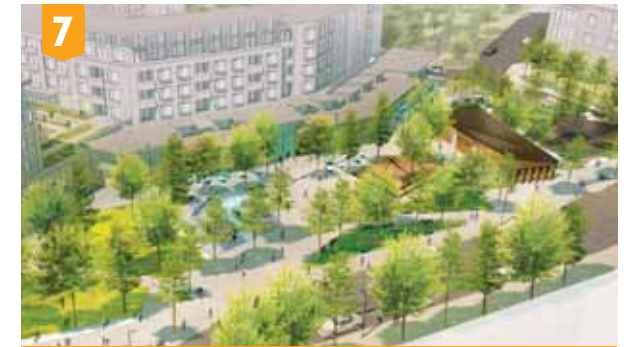
7 OPEN! Central Square 1.2 acre plaza