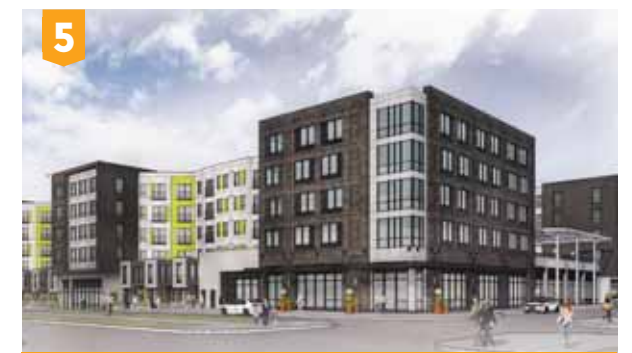
5 OPEN! 8877 Eaton 118 units/27k s.f. retail