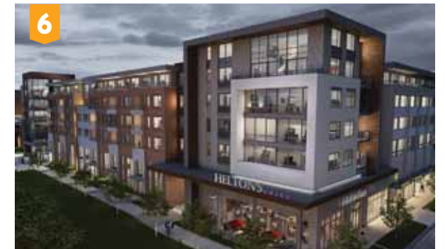
6 OPENING Q4 2019 Ascent Westminster 255 units/22k s.f. retail