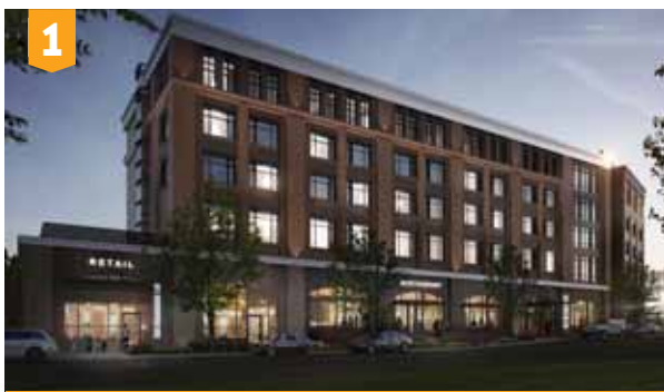
1 OPENING Q2 2020 Origin Hotel 125-room boutique hotel/15k s.f. retail