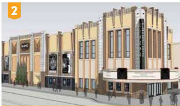
2 OPEN! Alamo Drafthouse 9-screen theater/restaurant