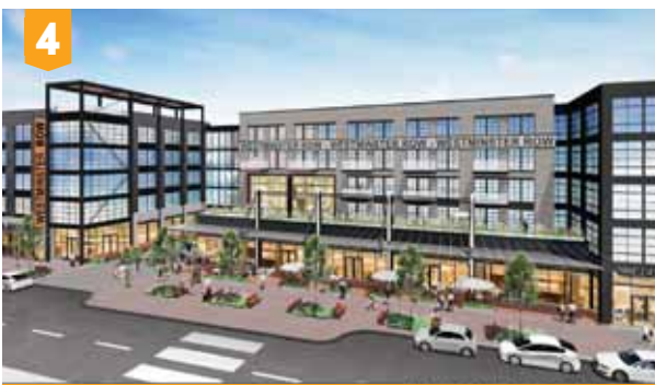
4 OPENING Q4 2021 Westminster Peak 283 units/17k s.f. retail