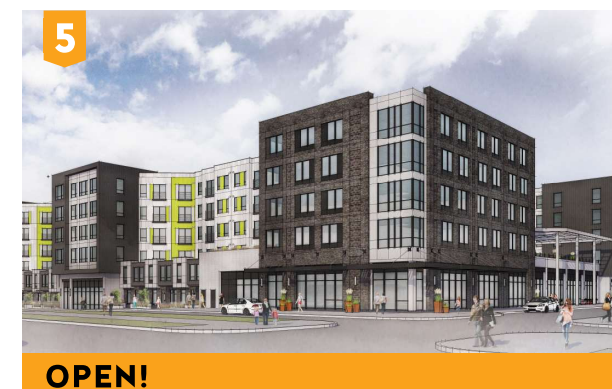
Eaton Street 118 units/27k s.f. retail