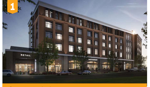
OPENING Q2 2020 Origin Hotel 125-room boutique hotel/15k s.f. retail