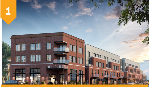
FUTURE TOWNHOMES & CONDOMINIUMS Downtown Westminster Residences